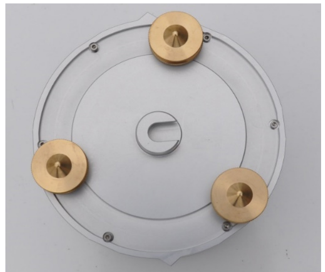
FIGURE 1 STRONG MOTION ACCELEROMETER

Acceleration Ground referenced Power Spectral noise estimate in 1 Hz bandwidth in units of (m^2/s^4)/Hz