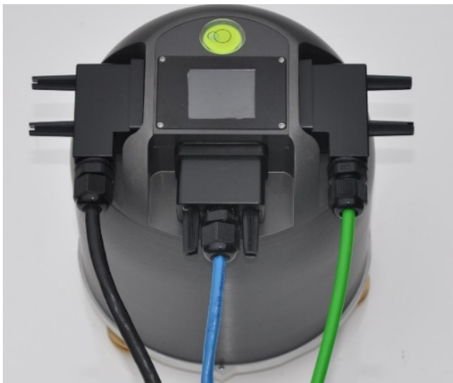
FIGURE 1 STRONG MOTION ACCELEROMETER

After installation the sensor output offsets are nulled with motorized zeroing mechanism.